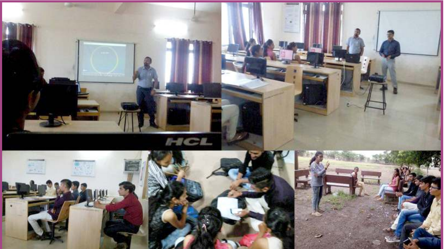
Bridge Course - A Bridge from Bachelor degree to Master Degree