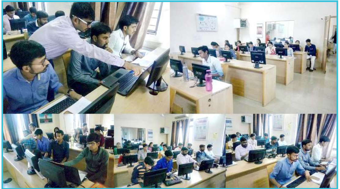
Students are doing live implementation during the workshop under faculty guidelines