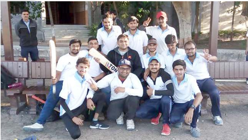
Cricket team of MCA