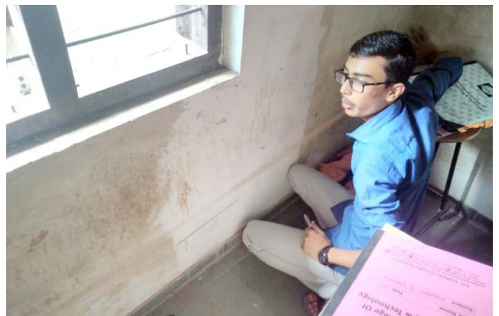
Measuring dimension of geotechnical engineering Lab