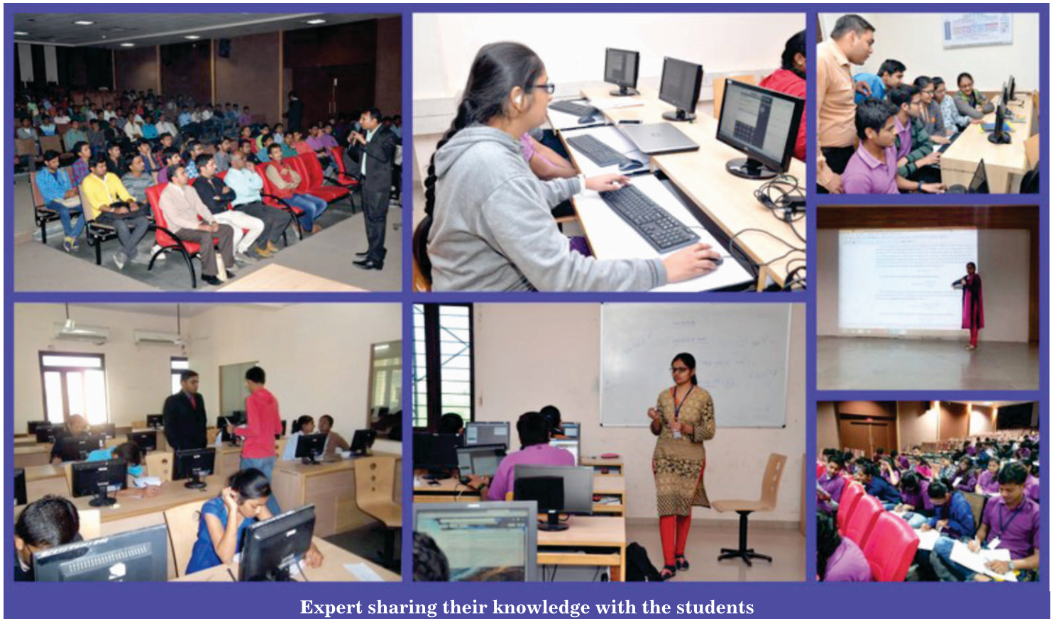
Expert sharing their knowledge with the students