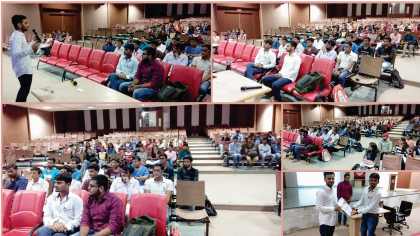
Industry Interaction with the expert