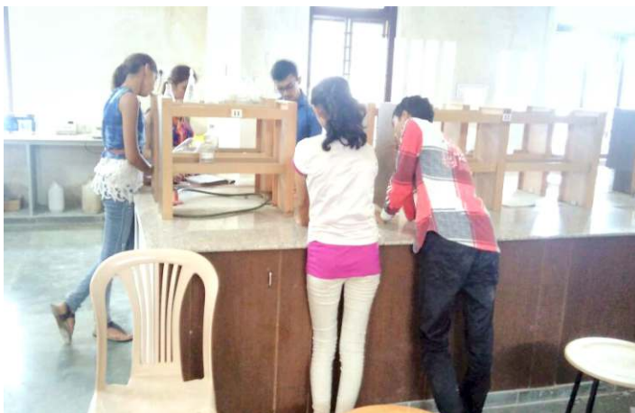
Measuring the dimension of Environmental Engineering Lab