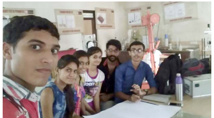
Dimensioning the data on sheet